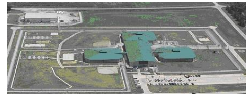
Clarinda Correctional Facility

Persons interested in employment opportunities within the Anamosa State Penitentiary should visit the Iowa Department of Corrections website at http://www.doc.state.ia.us . For questions regarding employment at the Anamosa State Penitentiary you may contact our Personnel Director at (319) 462-3504. The facility is located at 406 North High St, Anamosa, IA 52205.