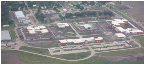
Iowa Correctional Institution for Women

Persons interested in employment opportunities within the Iowa Correctional Institution for Women should visit the Iowa Department of Corrections website at http://www.doc.state.ia.us . For questions regarding employment at the Iowa Correctional Institution for Women you may contact our Personnel Director at (515) 725-5005. The facility is located at 420 Mill Street SW, Mitchellville, IA 50169.