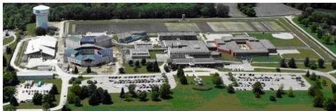
Iowa Medical & Classification Center

Persons interested in employment opportunities within the Iowa Correctional Institution for Women should visit the Iowa Department of Corrections website at http://www.doc.state.ia.us . For questions regarding employment at the Iowa Correctional Institution for Women you may contact our Personnel Director at (515) 725-5005. The facility is located at 420 Mill Street SW, Mitchellville, IA 50169.