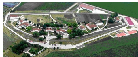
North Central Correctional Facility

Persons interested in employment opportunities within the Newton Correctional Facility should visit the Iowa Department of Corrections website at http://www.doc.state.ia.us . For questions regarding employment at the Newton Correctional Facility you may contact our Personnel Director at (641) 792-7552. The facility is located at 307 S 60th Ave West, Newton, IA 50208.