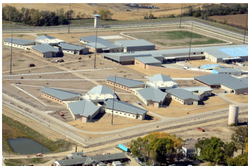
Iowa State Penitentiary

Persons interested in employment opportunities within the Iowa Medical & Classification Center should visit the Iowa Department of Corrections website at http://www.doc.state.ia.us . For questions regarding employment at the Iowa Medical & Classification Center you may contact our Personnel Director at (319) 626-4220. The facility is located at 2700 Coral Ridge Avenue, Coralville, IA 52241.