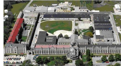
Anamosa State Penitentiary

Persons interested in employment opportunities within the Anamosa State Penitentiary should visit the Iowa Department of Corrections website at http://www.doc.state.ia.us . For questions regarding employment at the Anamosa State Penitentiary you may contact our Personnel Director at (319) 462-3504. The facility is located at 406 North High St, Anamosa, IA 52205.