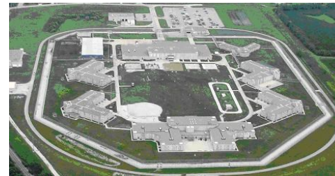
Fort Dodge Correctional Facility

Persons interested in employment opportunities within the Clarinda Correctional Facility should visit the Iowa Department of Corrections website at http://www.doc.state.ia.us . For questions regarding employment at the Clarinda Correctional Facility you may contact our Personnel Director at (712) 542-5634. The facility is located at 1800 N 16th, Clarinda, IA 51632.