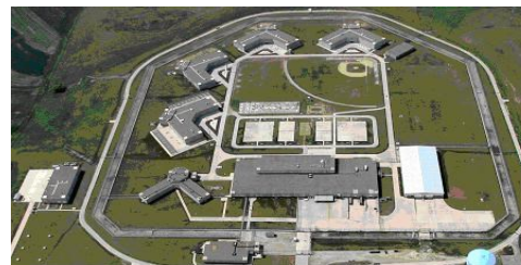
Newton Correctional Facility

Persons interested in employment opportunities within the Mount Pleasant Correctional Facility should visit the Iowa Department of Corrections website at http://www.doc.state.ia.us . For questions regarding employment at the Mount Pleasant Correctional Facility you may contact our Personnel Director at (319) 385-9511. The facility is located at 1200 East Washington St, Mount Pleasant, IA 52641.