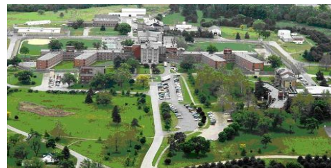
Mount Pleasant Correctional Facility

Persons interested in employment opportunities within the Mount Pleasant Correctional Facility should visit the Iowa Department of Corrections website at http://www.doc.state.ia.us . For questions regarding employment at the Mount Pleasant Correctional Facility you may contact our Personnel Director at (319) 385-9511. The facility is located at 1200 East Washington St, Mount Pleasant, IA 52641.